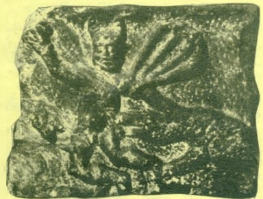
FROM A ROMAN TOMB with a relief of ACTAEON changing into a stag and being devoured by his dogs. (Size 30" x 24" x 10").

The Blossoms can provide you with a chance to relax in the comfort you would expect in one of the north's finest hotels.