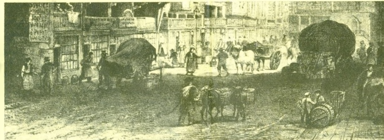
BRIDGE STREET, c.1830 From a drawing by G. Pickering