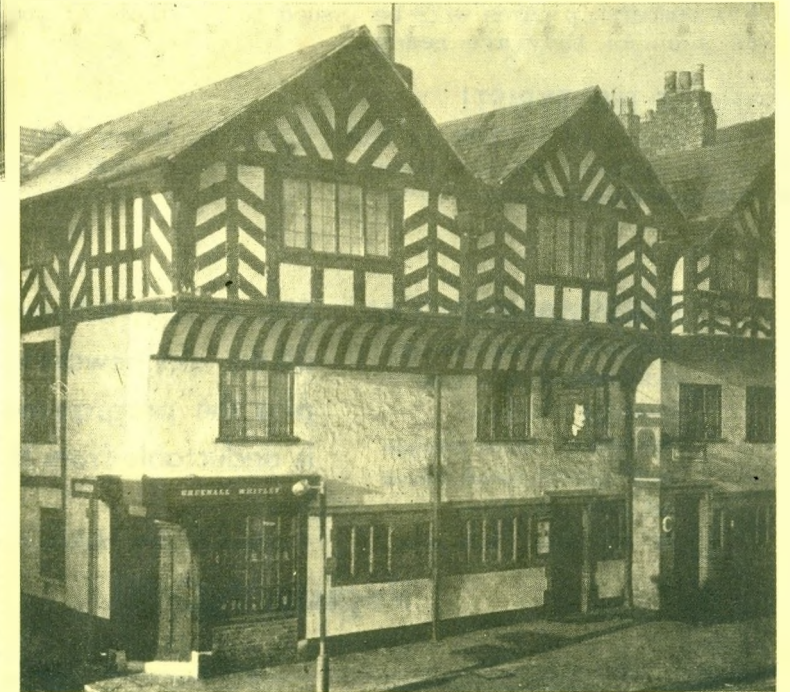
The Old King's Head in Lower Bridge St.